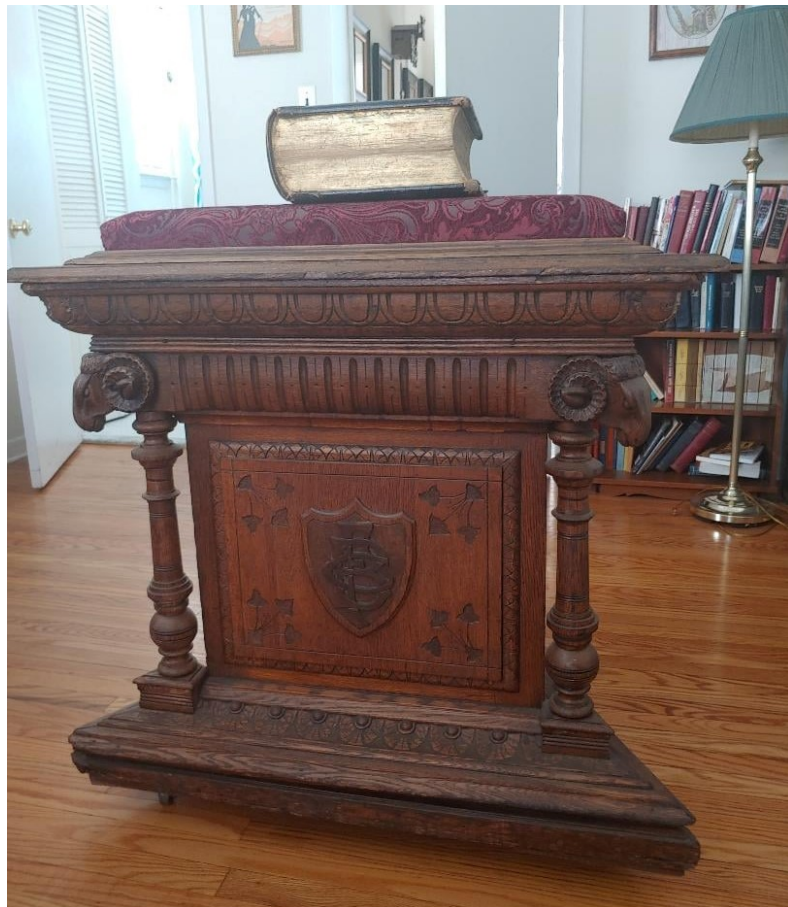
Franklin's Altar and Bible used to initiate F.D.R.